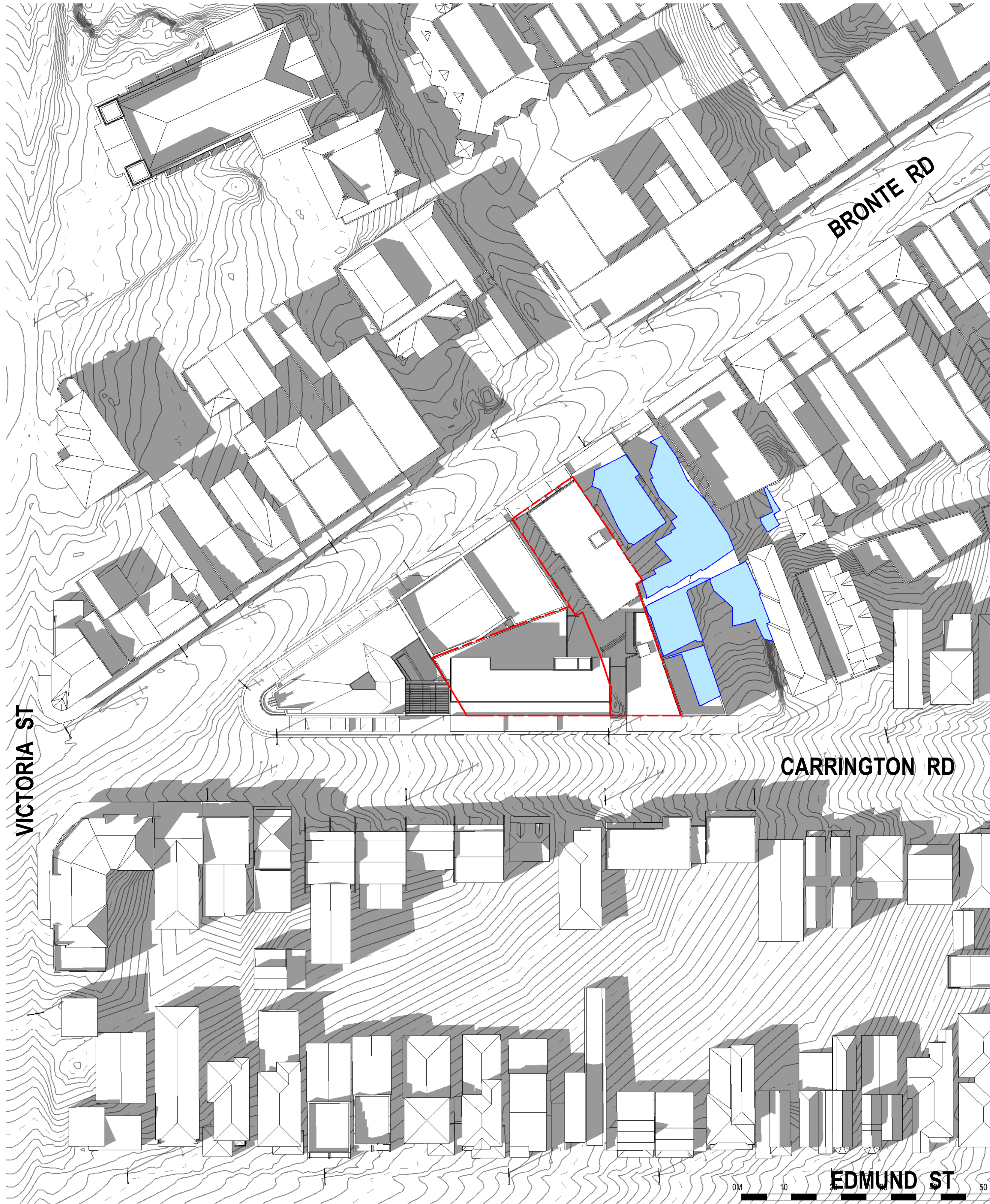
2 Shadow Plan - Proposed - Winter Solstice 1:00PM 1 : 500