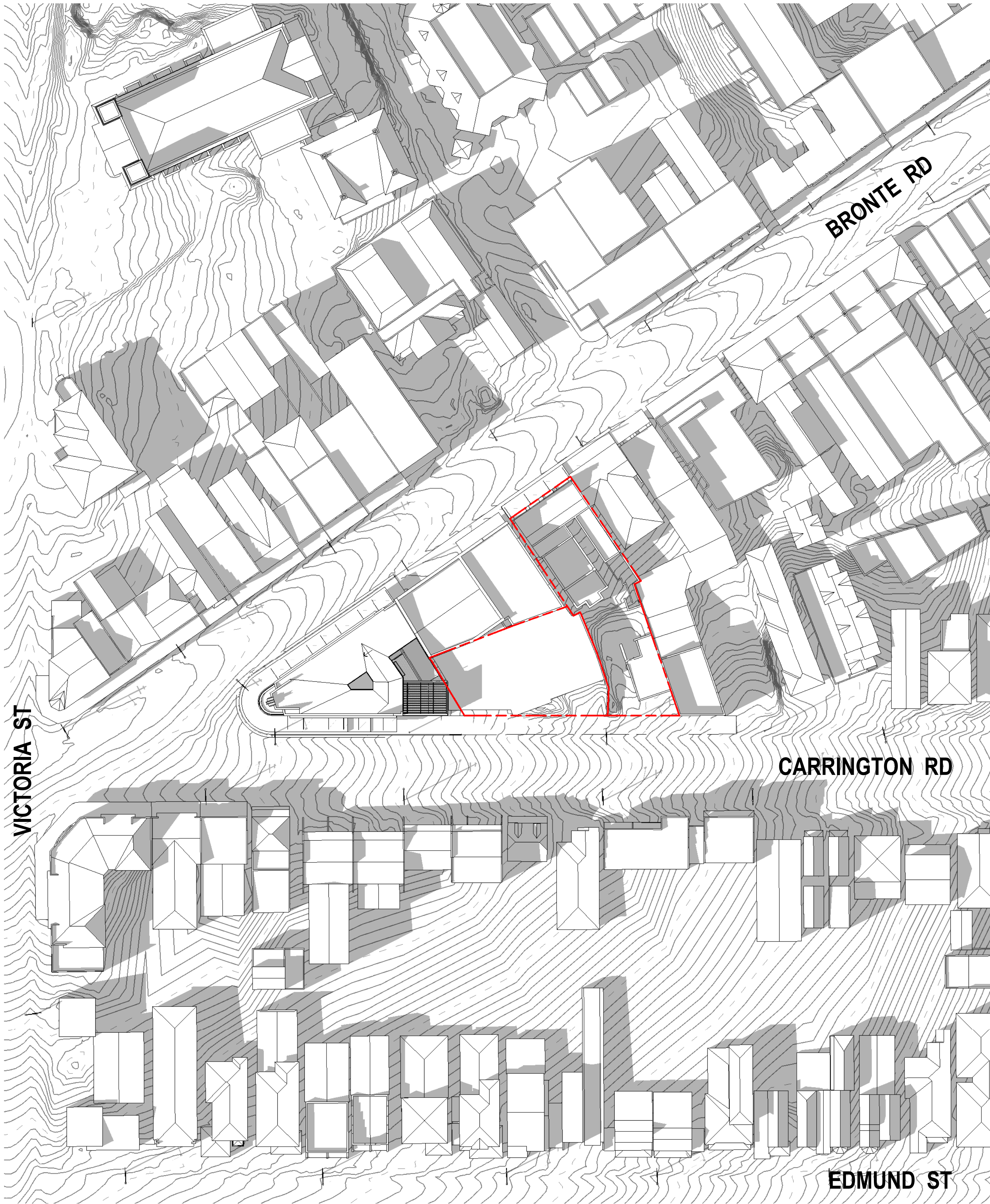
1 Shadow Plan - Existing - Winter Solstice 1:00PM 1 : 500

General Notes The copyright of this design remains the property of H&E Architects. This design is not to be used, copied or reproduced without the authority of H&E Architects. Do not scale from drawings. Confirm dimensions on site prior to the commencement of works. Where a discrepancy arises seek direction prior to proceeding with the works. This drawing is only to be used by the stated Client in the stated location for the purpose it was created. Do not use this drawing for construction unless designated.